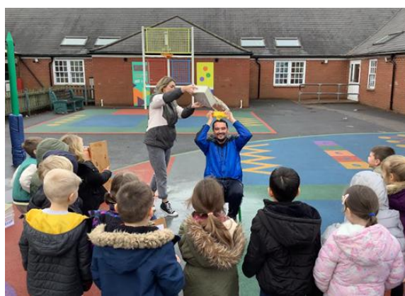
Best day ever!