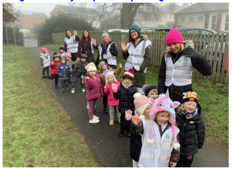
Big thank you to our volunteers

The children were so well behaved and really safe walking on the pavement, we were lucky to get a friendly beep from a passing tanker too!